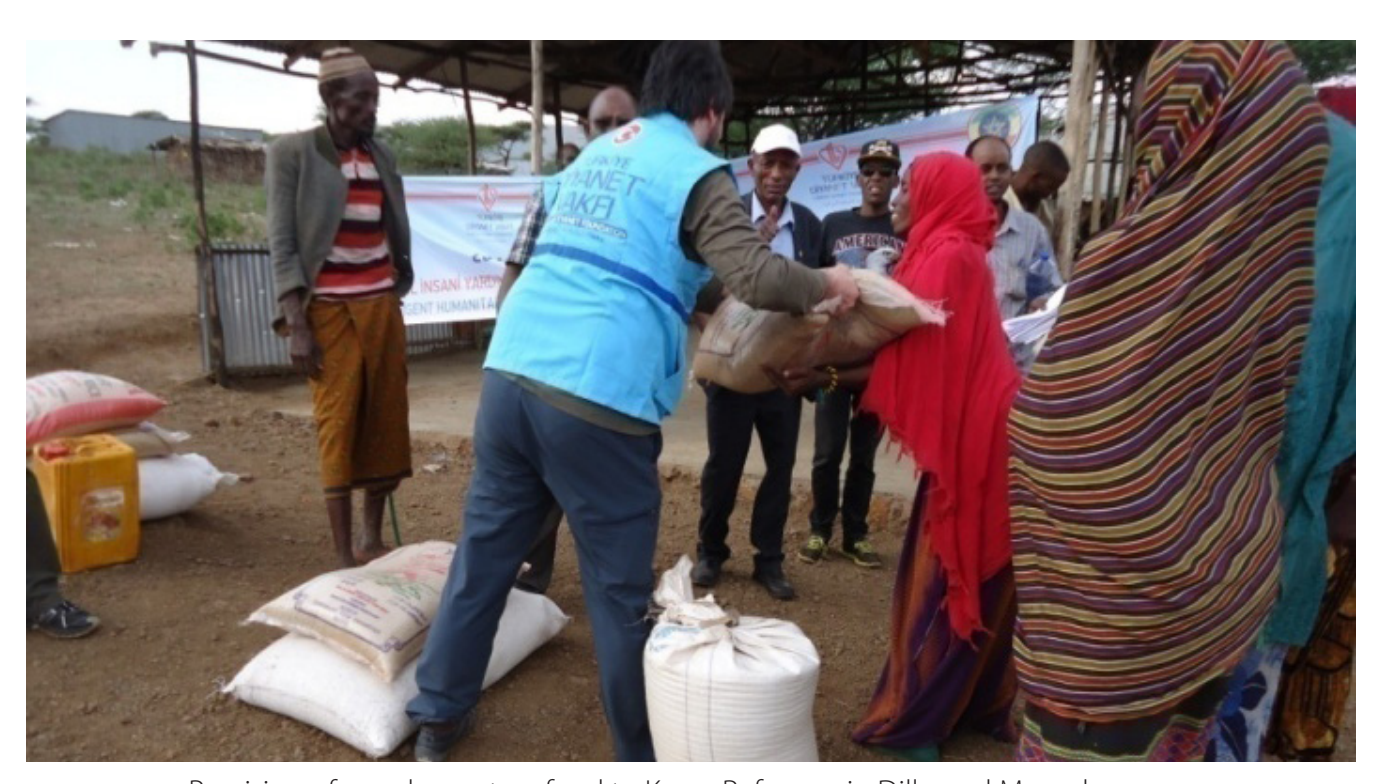
Provision of supplementary food to KenyaRefugees in Dillo and Megado camps