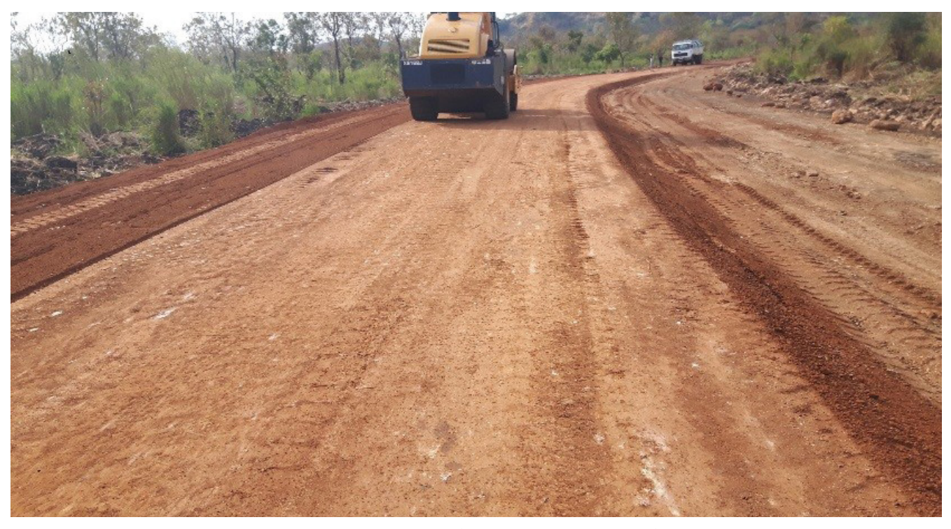
Gravel road construction for south Sudanese refugee in Nguyyiel refugee camp, Gambella (UNHCR support)