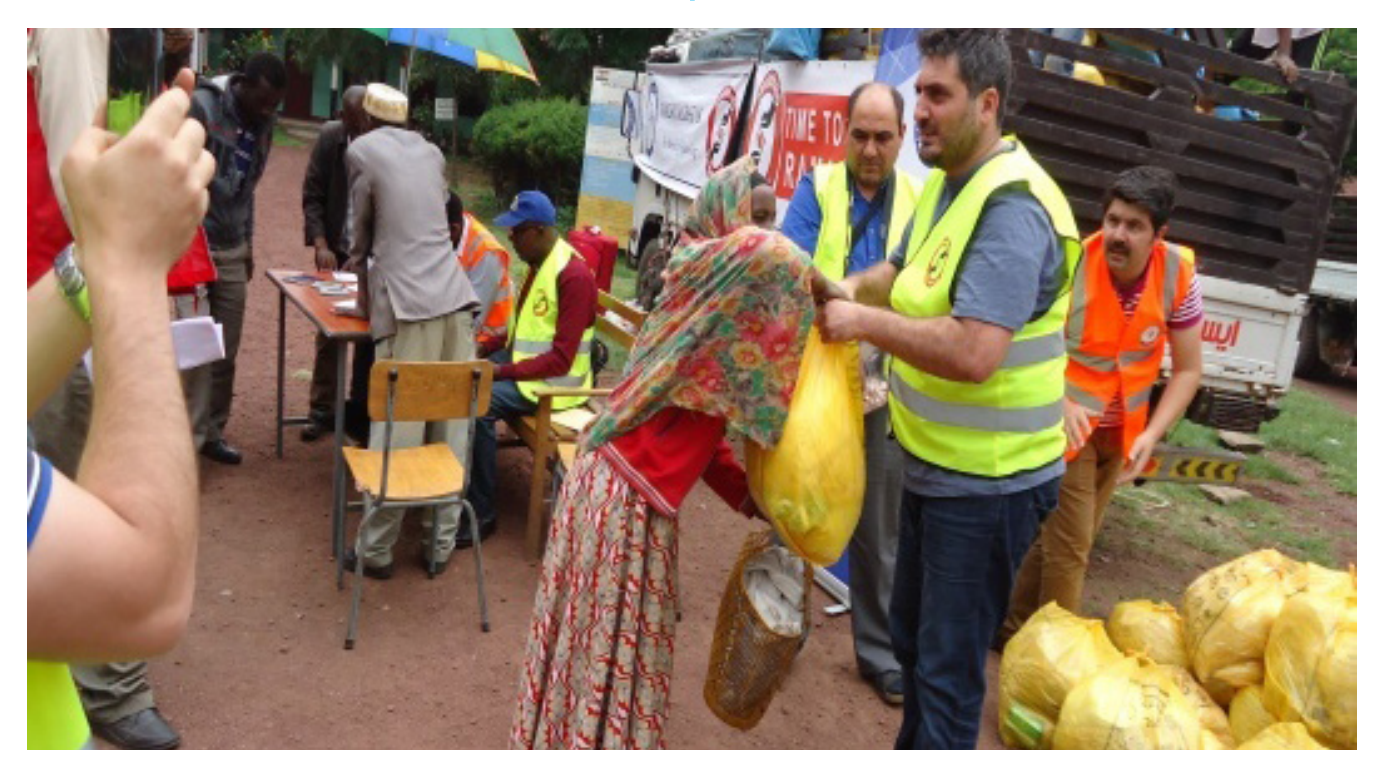
Distribution of supplementary food in in drought affected community of Sude district (TIKA Support)