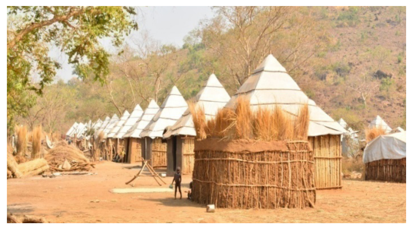
Transitional shelter constructed for south Sudanese refugee in Terkidi refugee camp Gambella (UNHCR Support)