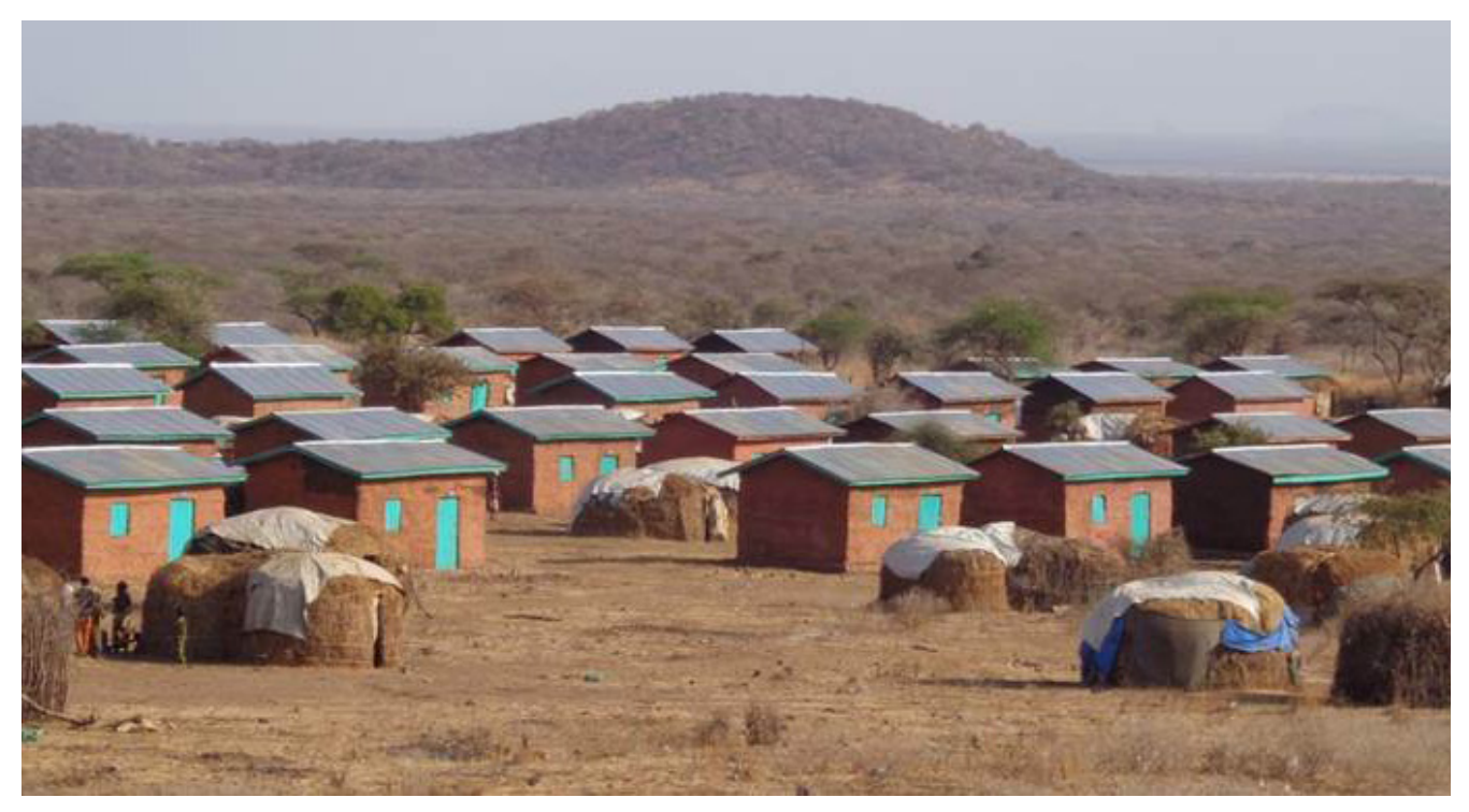
Improved transitional shelter constructed for Kenyan Borena refugees in Megado and Dillo camps.