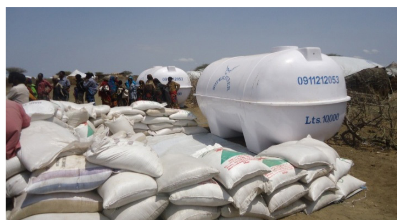
Provision of supplementary food to KenyaRefugees in Dillo and Megado camps