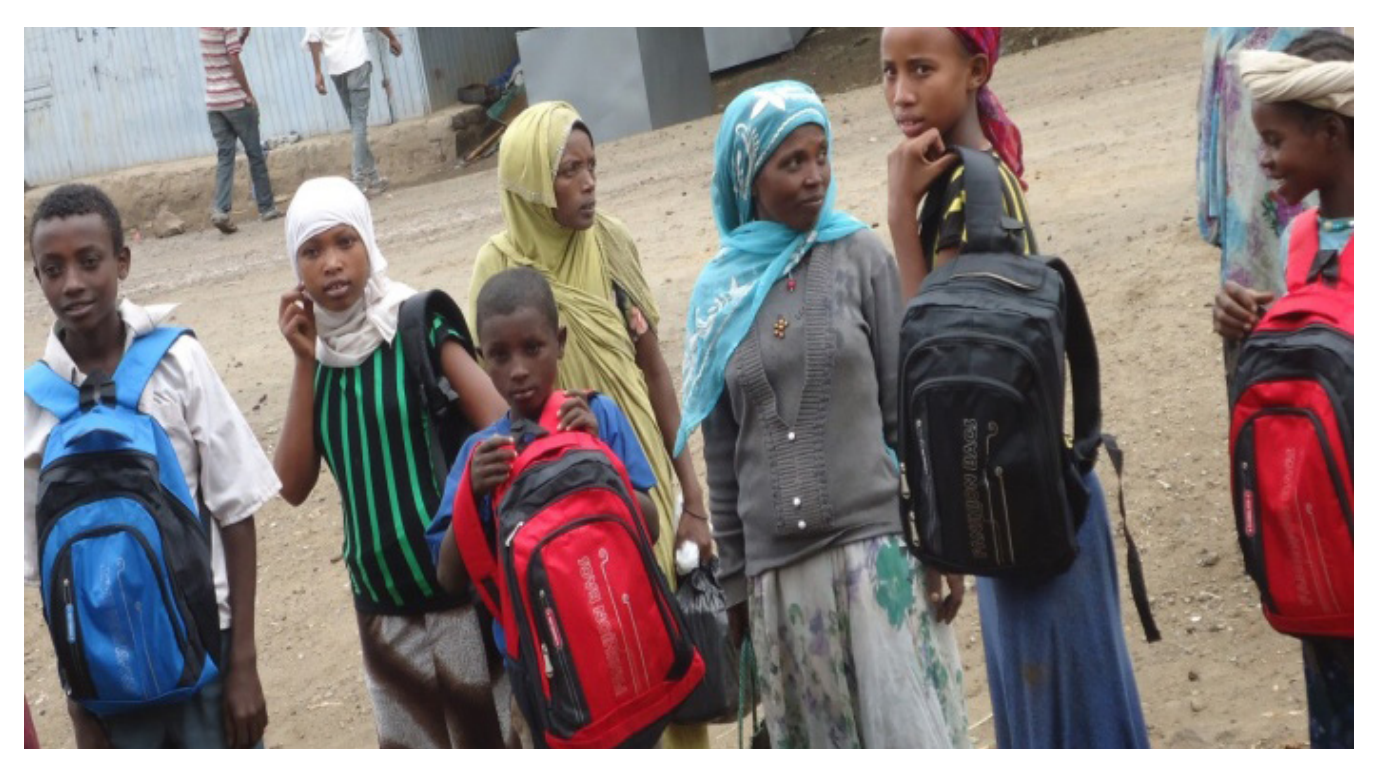
Educational Material Support for Orphan and vulnerable children, Abomsa Town (TIKA Support)