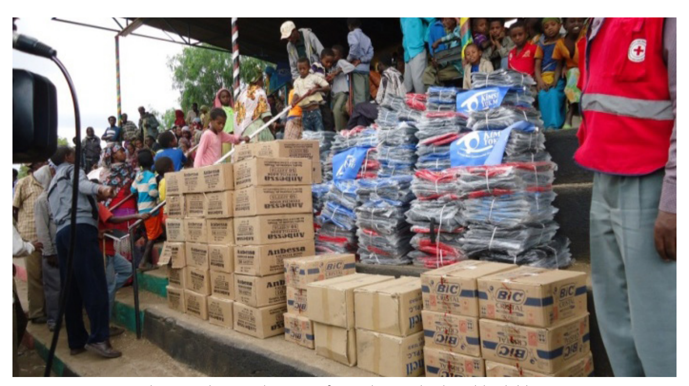
Educational Material Support for Orphan and vulnerable children, Abomsa Town (TIKA Support)