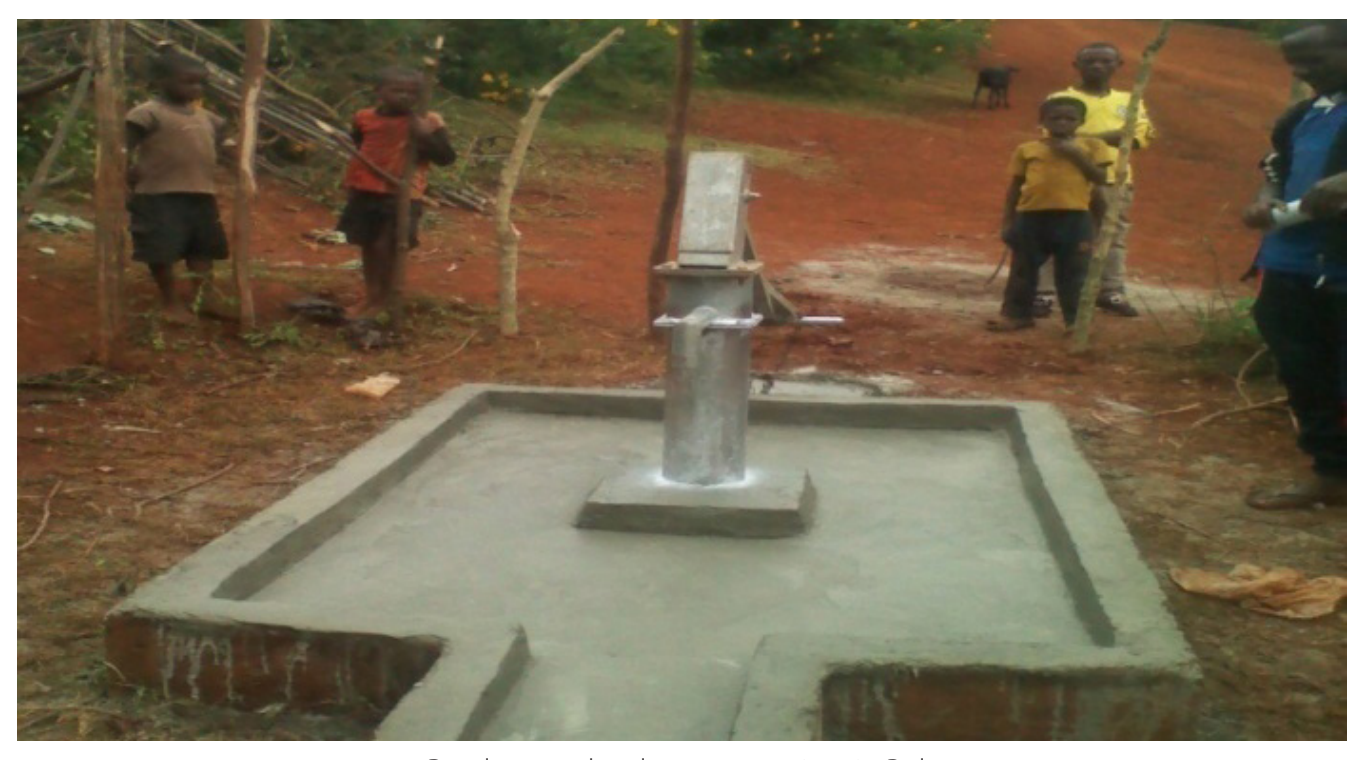
Rural water development project in Bule Hora woreda of Borena zone (TIKA Support)