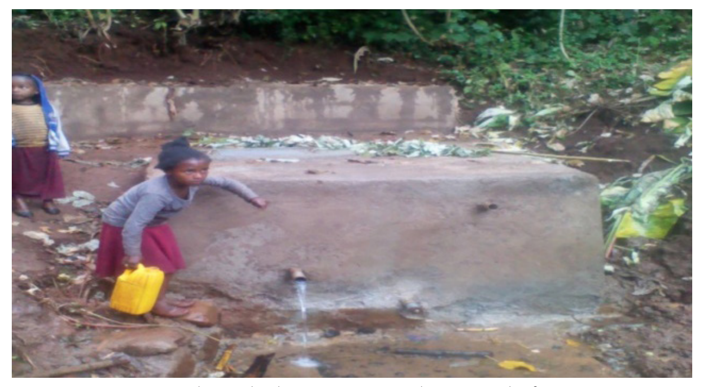
Rural water development project in Bule Hora woreda of Borena zone (Japan Embassy Support)