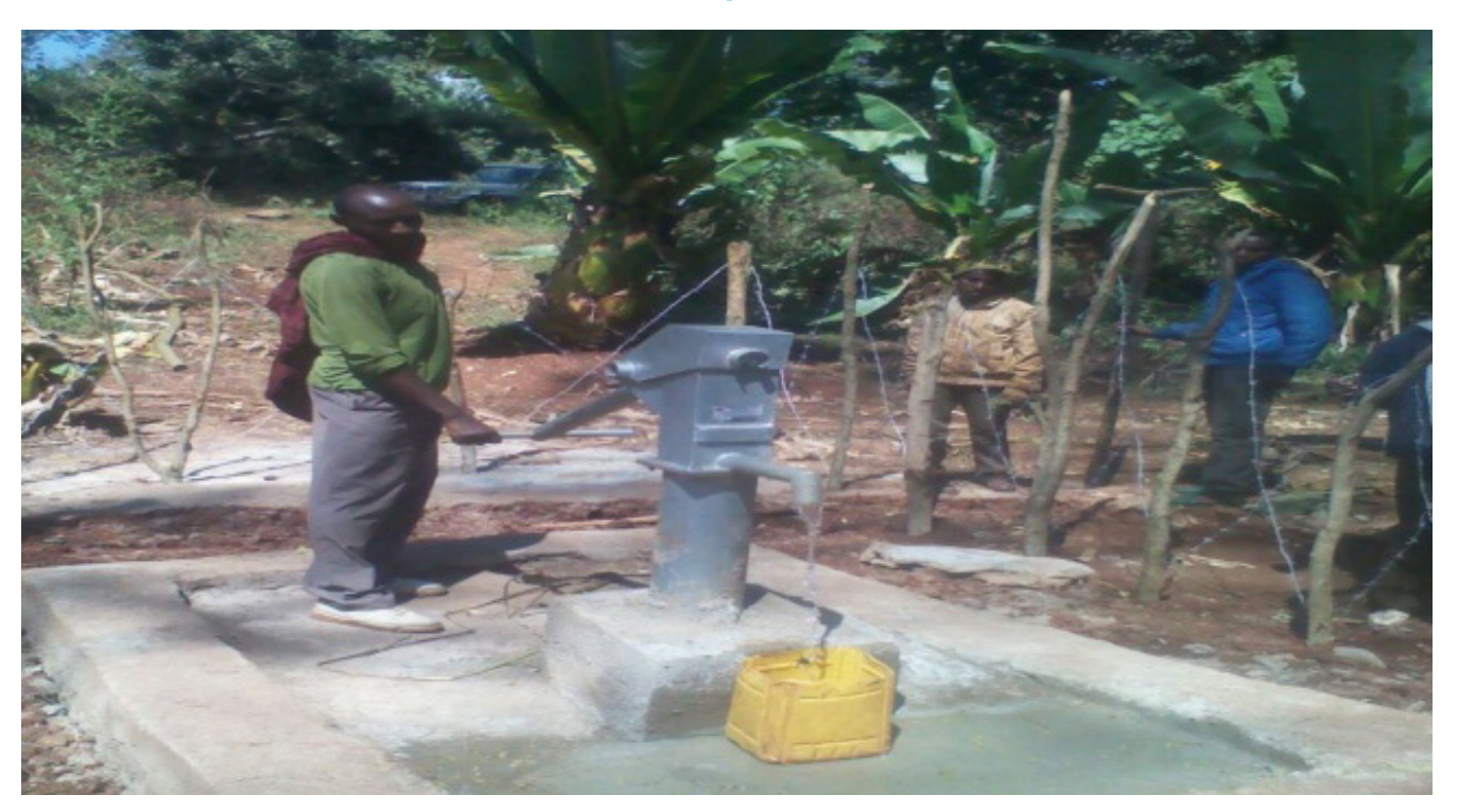
Rural water development project in Bule Hora woreda of Borena zone (Japan Embassy Support)