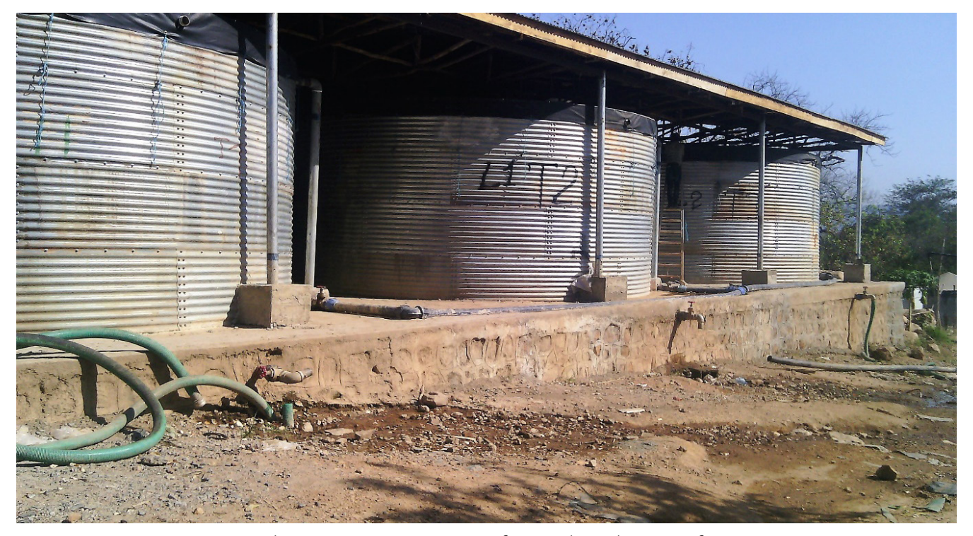
Diversion and water system operation for south Sudanese refugee in Jewi, Gambela(UNHCR Support)