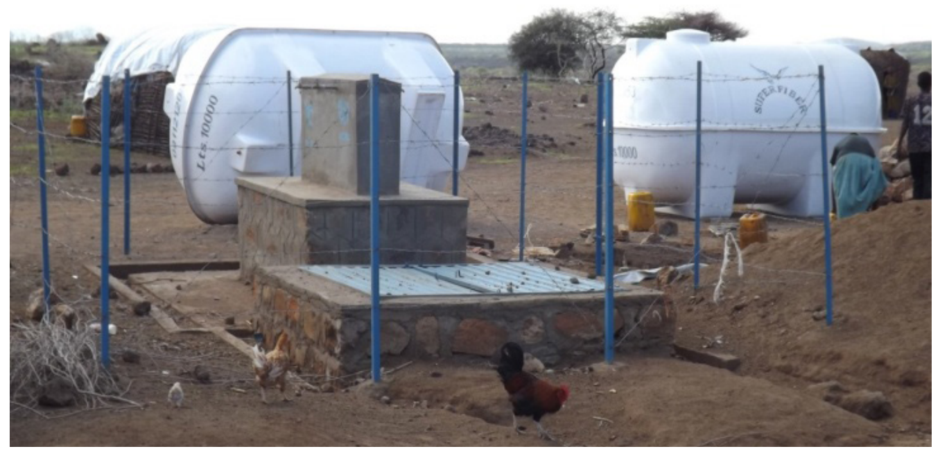
Water tanker installation in Dillo and Megado Refugee camps in Oromia Region (UNHCR Support)