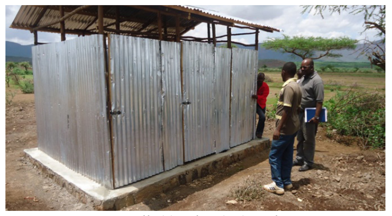
Construction of family latrine for south Sudanese refugee in Jewi refugee camp, Gambella (UNHCR Support)