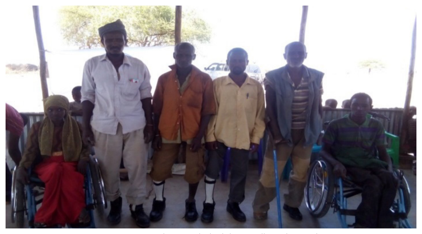
Support person living with disability in Dillo and Megado (UNHCR & Cheshire service Ethiopia Support)