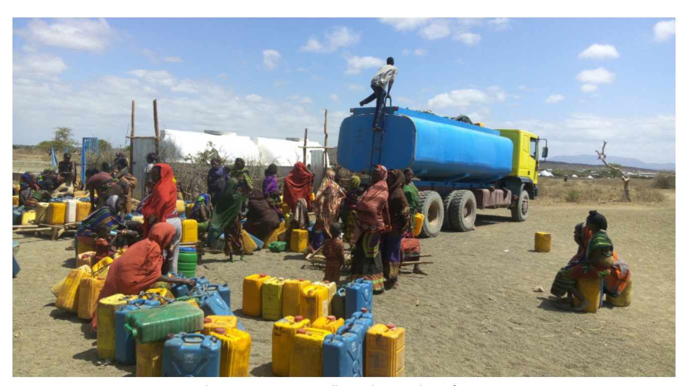
Water trucking operation in Dillo and Megado Refugee camps in Oromia Region (UNHCR Support)