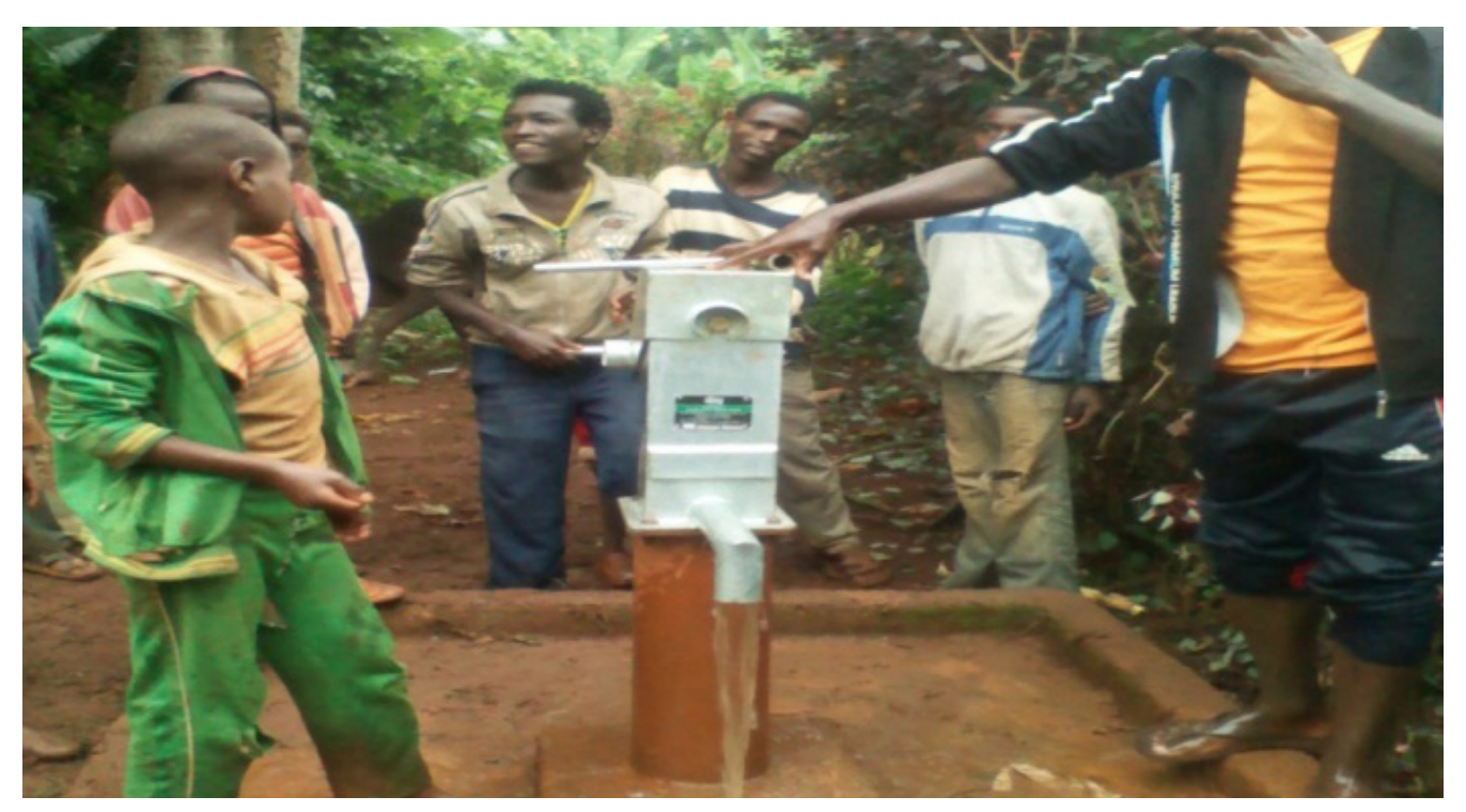
Rehabilitation of water schemes at Bule-Hora Woreda (TIKA Support)