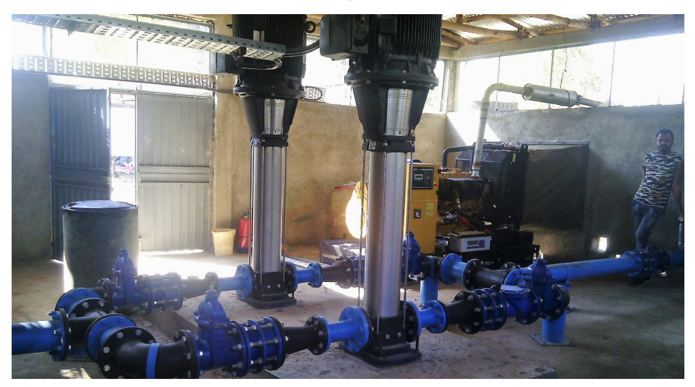
diversion and water system operation for south Sudanese refugee in Jewi, Gambela(UNHCR Support)